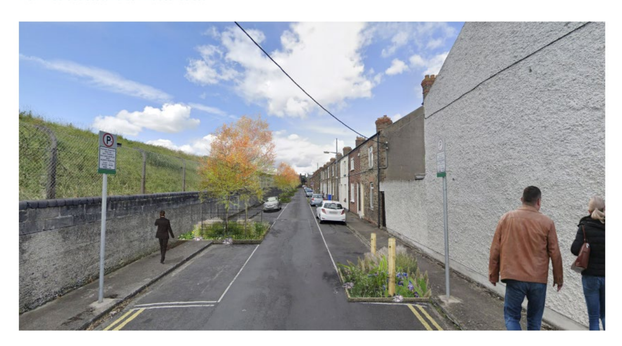
View A From Mable Street towards Elizabeth Street

Dublin City Council Parks, Biodiversity and Landscape Department have progressed the plans for the greening of Elizabeth Street in Drumcondra, in conjunction with E&T department. The greening works will involve tree —build-outs on the southern side of the street, which will include SuDs tree pits, containing 7 no. new trees and pollination friendly planting schemes. These works will involve the removal of 11 no. paid parking spaces along the southern side of the street.